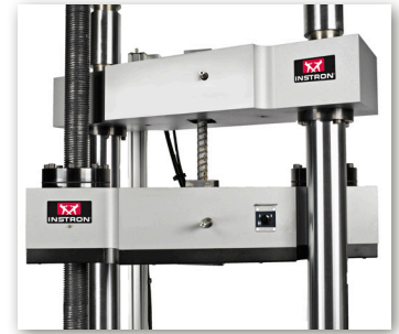
G1 - Closed with Manual Crank and Pinion