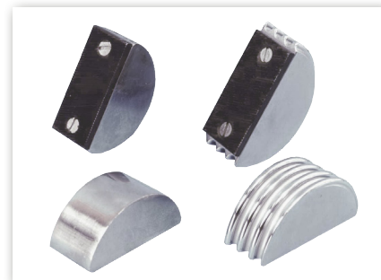
A selection of interchangeable capstans to meet with a variety of applications