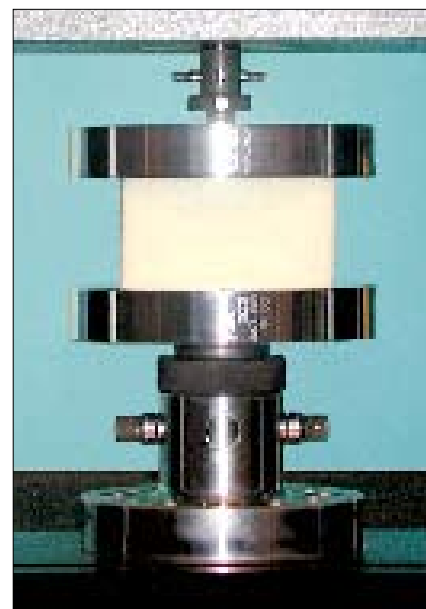
▲ Platens forming compression test on a foam specimen

The compression fixture has been designed to easily provide the capability of compression. Platens are rigidly fixed and are non self-aligning. They have a high stiffness that resists off-centre loads, this retains the parallelism during specimen failure. Universal spherical seating is designed for use with compression anvils to ensure that loading is concentrically and evenly applied to specimens that do not stand perpendicular to the platen surface.