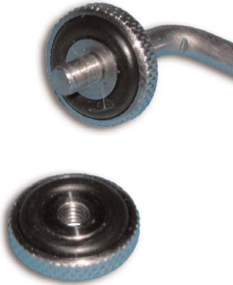
▲ Close up of o-rings