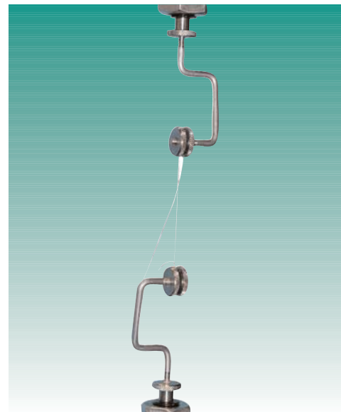
▲ Micro fiber grip

The grip body is shaped so that the center line of the loading force passes exactly through the center line of the fiber when the fiber is correctly loaded.